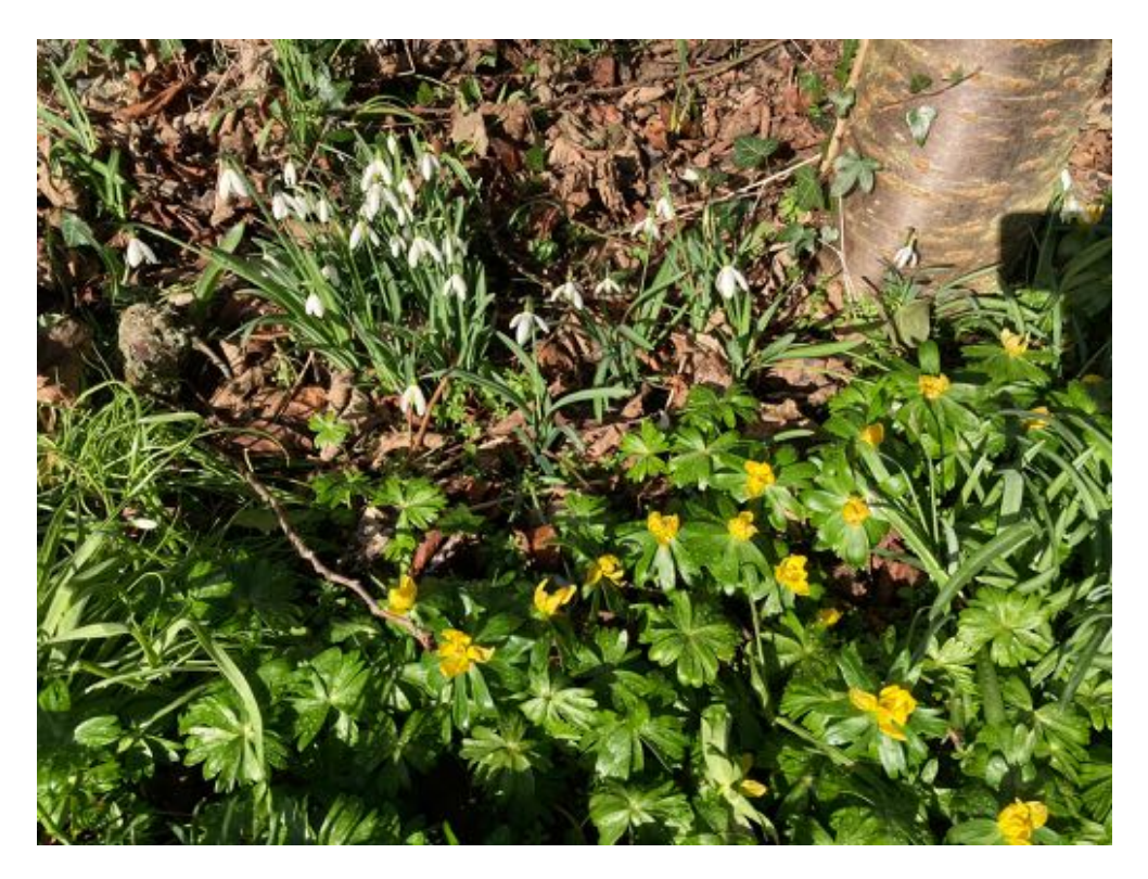
Signs of Spring on the Church Border