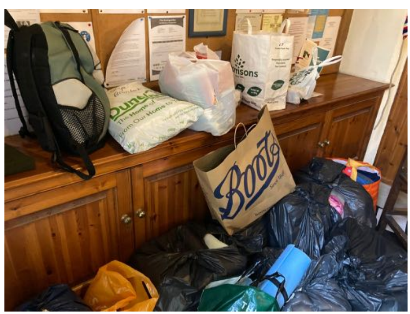
We had a great response

from the village for donations for refugees from Ukraine. Goods were taken to Longhoughton then onto Newcastle and then to Poland. They will contribute to the ongoing effort to help those families who have been left homeless.